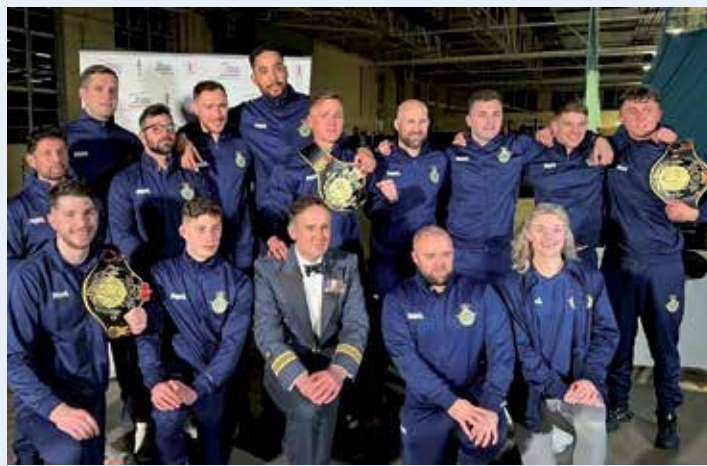
RAF Boxing Team