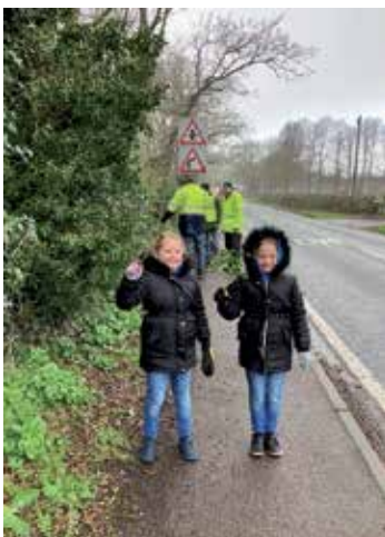
'Clean for the Queen'