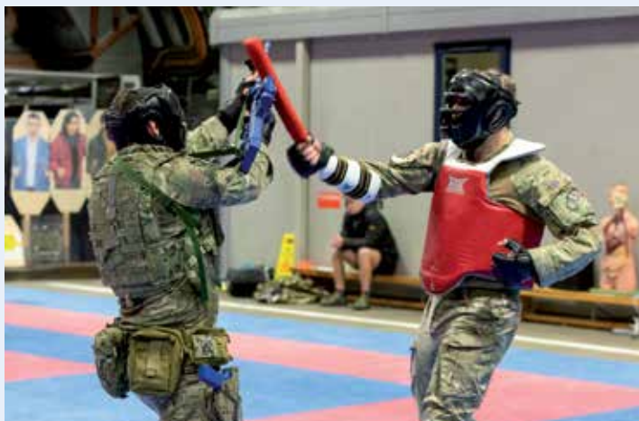
Combat