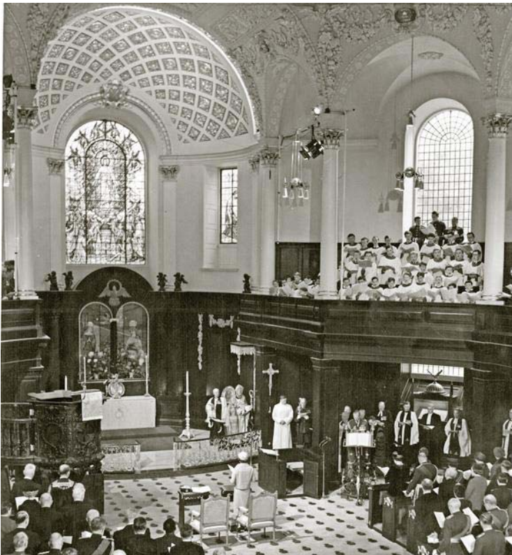
Pictured above, Her Majesty at the Reconsecration of St Clement Danes in 1958

We pray for Her Majesty to continue in strength.