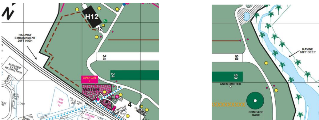
RESA at RAF Cosford

2.6. RWY End Safety Area (RESA). Full obstacle clearance cannot be met on the approach to all runways: there is a 60ft ravine 90m into the overshoot of RWY24 and a 20ft railway embankment 280m into the overshoot of RWY06, shown below: