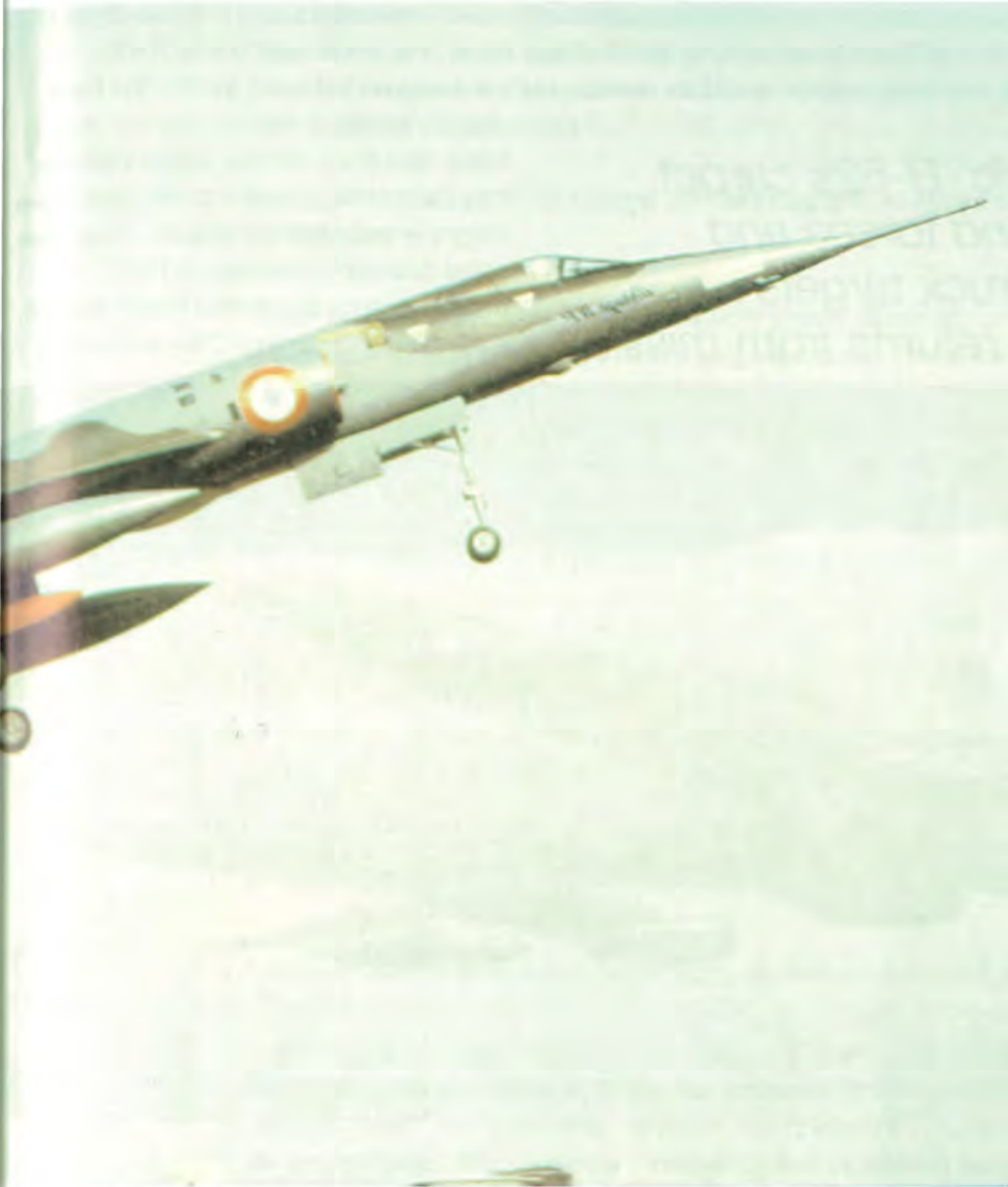
Rocket assisted take off for Mirage IV operated as part of the French strategic bomber force

lesser extent, with the roles of RAF's Bomber Command and the French nuclear bomber force. In some minds, air power was strategic bombing. The immeasurable impact of the Berlin Airlift on the destiny of Europe was ignored; the continuous irreplaceable contribution of reconnaissance throughout the Cold War received little public acclaim from air power enthusiasts.