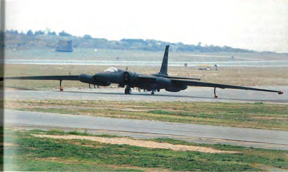
U2/TR1A high altitude manned reconnaissance aircraft

Clearly though, aerospace observation systems likely will retain critical weaknesses in the foreseeable future. They still can not see under roofs, open boxes of contraband, look into vehicles, or in all the other places peacekeepers must explore. Perhaps most importantly, aerospace systems can not look into someone's eyes during an interview, meeting, or interrogation. But, by gathering key information, like the existence of mass graves and the presence of factional forces in the wrong places, aerospace observation can make the job of land-based observation much easier, certain, and productive. The point here is that land and aerospace observation are indispensable elements of the same task of just knowing what's going on. But, because aerospace observation systems can do an ever wider range of tasks more cheaply, more safely, and often better than land systems, their role in operations and the budget must be addressed carefully.