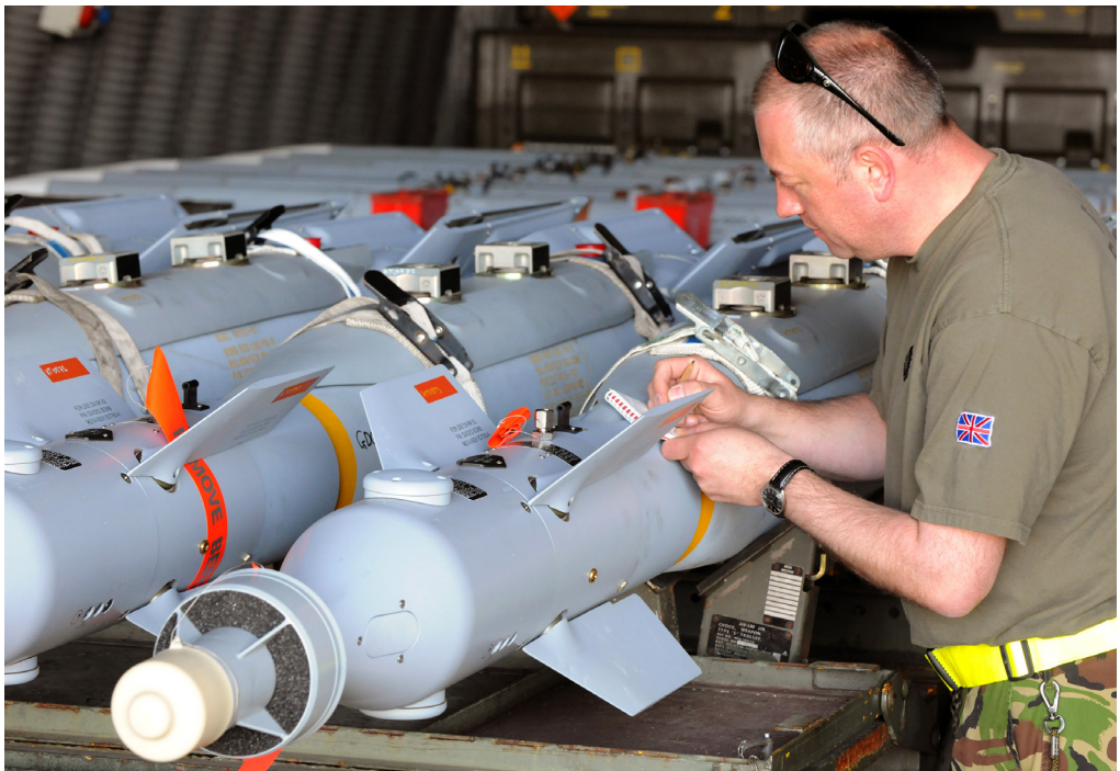
Armourers position and check Enhanced Paveway IV bombs prior to loading them onto aircraft taking part in Operation Ellamy.

At the tactical level it is a fact that major combat operations invariably lead to the identification of multiple equipment deficiencies and proposals for enhancement, yet such recommendations were few during the conflict, and UK combat air capabilities quickly became central to the coalition effort. Throughout, the Tornado GR4 performed with characteristic effectiveness in the ground-attack and tactical reconnaissance roles. The detachment of 12 GR4s based at Gioia del Colle formed the spearhead of the UK air component in April, May and June and was enlarged to 16 aircraft in July to fulfil the requirements of the projected surge. Odyssey Dawn opened with GR4-launched