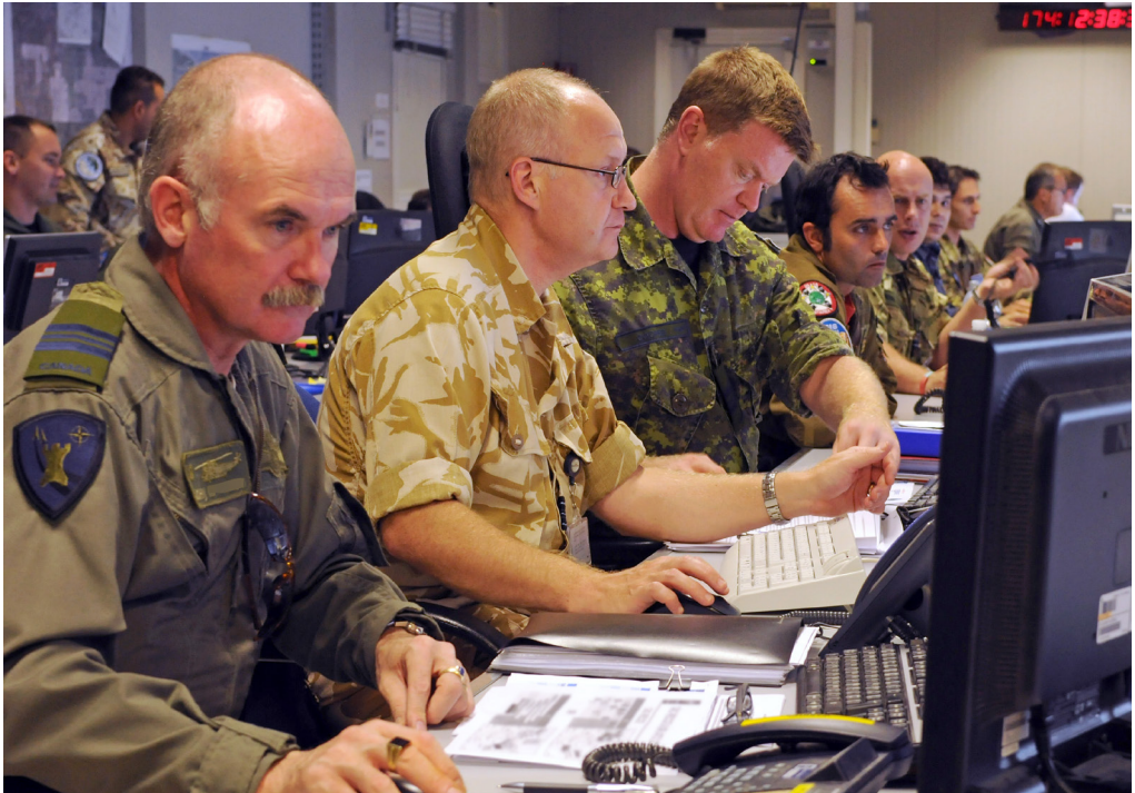
An RAF officer works alongside staff from multiple NATO countries in the CAOC at Poggio, the operational centre for the air campaign over Libya.

The strategy linked so-called 'decisive conditions' to objectives, tasks and targets within the component planning and joint planning processes. However, it also stressed that military operations had to be conducted in parallel and in coordination with extensive strategic communications (STRATCOM), IO and psychological warfare activity to stand any chance of exerting genuinely coercive effect. Clear and quantifiable measures of campaign progress were suggested and there was a detailed strategy-to-task breakdown. As far as the future direction of the air campaign was concerned, particular importance was attached to the sequenced targeting of command, control and communications to isolate the regime from the key instruments of power.