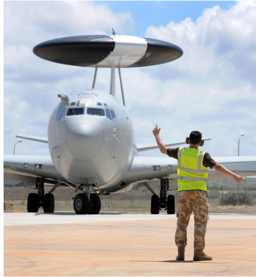
An RAF E-3D Sentry prepares to taxi at Trapani air base in Sicily, bound for operations in support of NATO forces over Libya.

Nevertheless, resources were never adequate and important command decisions – notably judgements on target clearance – had often to be made on the basis of far less