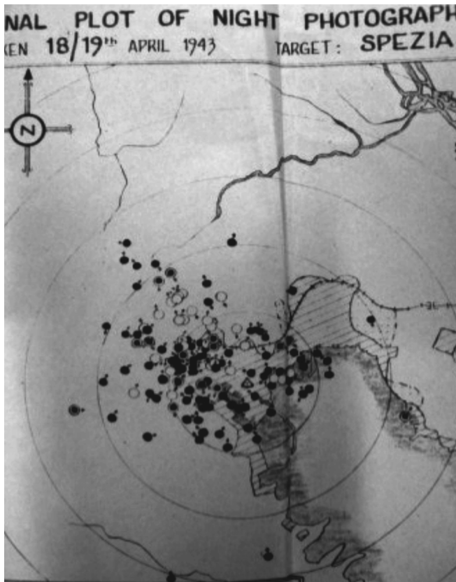
Map III: Bomb-Plot chart for 18-19 raid 96

no hits on the three Littorio class (battle)ships. 93 One hundred and seventy-three Lancasters from 1, 3, 5 and 8 Groups, and five PFF Halifaxes, returned five nights later. 94 The post-raid report observed that ‘a good concentration, a little north west of the aiming point, was achieved’ (see Map III) in which ‘the Naval Dockyard and the town suffered more severely than on the night of 13-14th April’. Through a combination of HE and incendiary bombs, serious damage was done to the industrial and residential areas of the town, with direct hits on the San Vito arsenal and main railway station. A ship of the RMI was sunk but it was an Orlandi-class destroyer ( Aviere ), not a Littorio-class battleship, which all went unharmed again. 95