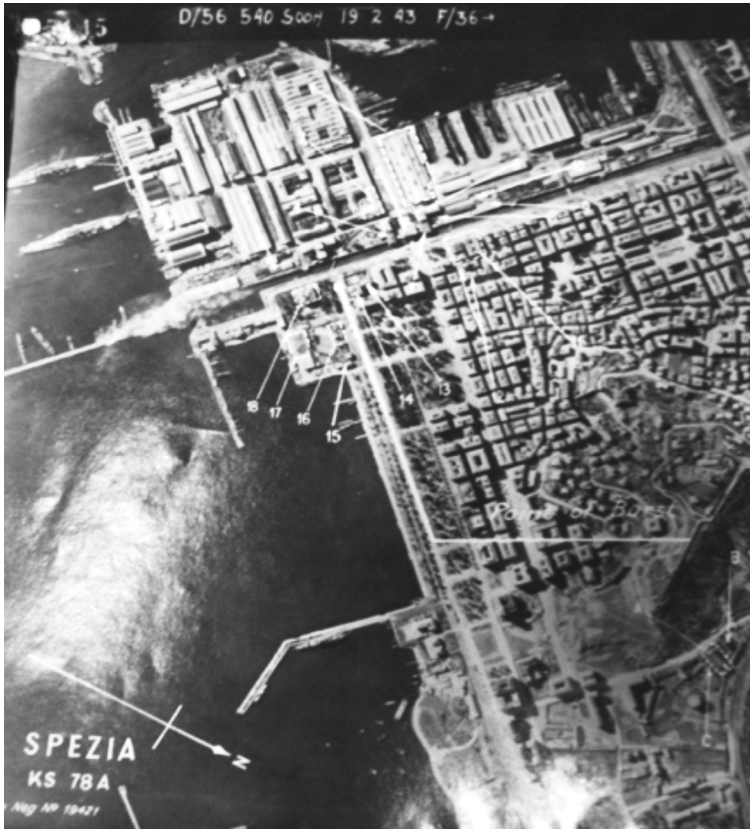
Photograph 1: Reconnaissance photograph of Spezia harbour (note: two battleships can be seen top left) 68

and minor roof damage over a wide-area. 67 These two split-attacks show that, although Harris had cooperated in attacking Italian targets, there was a limit to his effort to assist the Navy's objectives in the Mediterranean. Italy's war industries and civilian morale remained Bomber Command's true targets, not its naval bases.