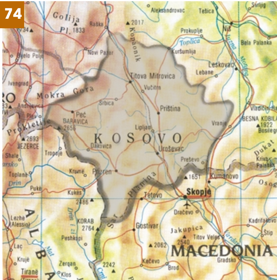
Figure 1: Map of Kosovo

In developing the air plan against the Serbian 3rd Army, air planners focused on adapting a combination of known techniques to the situation. Air superiority would be achieved by NATO Airborne Early Warning (NAEW) and a continuous fighter presence. 49 To counter the SA-6 threat, USAF F-16CJ (Block 50) and German ECR Tornados provided reactive cover with High-speed Anti-Radiation Missiles (HARMs). Also, US Navy and Marine EA-6Bs jammers and “Compass Call” USAF EC-130s would confuse and degrade the Serbian Integrated Air Defense System (IADS).