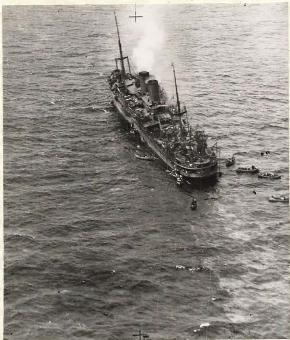
Passengers and crew abandoning the P. & O. liner Cathay when she began to sink after being torpedoed in the Mediterranean on 11th November 1942.