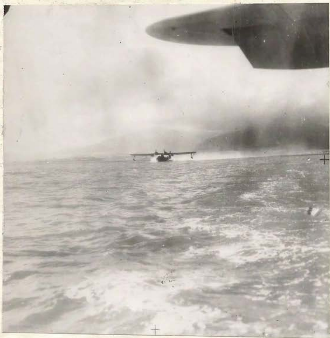
A Catalina of No. 202 Squadron taking-off. Algeciras is on the left.