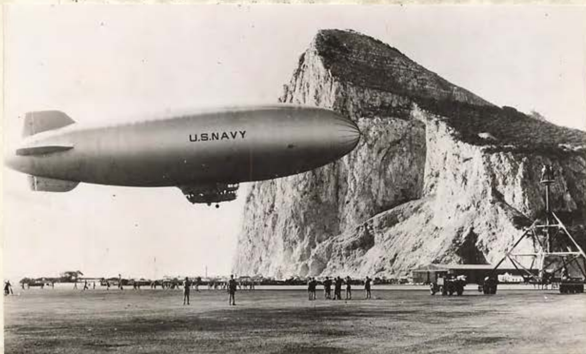
Later, it was decided that Gibraltar would be a handy diversion base for the Blimps. A mobile mast was erected at North Front and on 20th July, 1944, an experimental trip was made. (21st July, 1944)