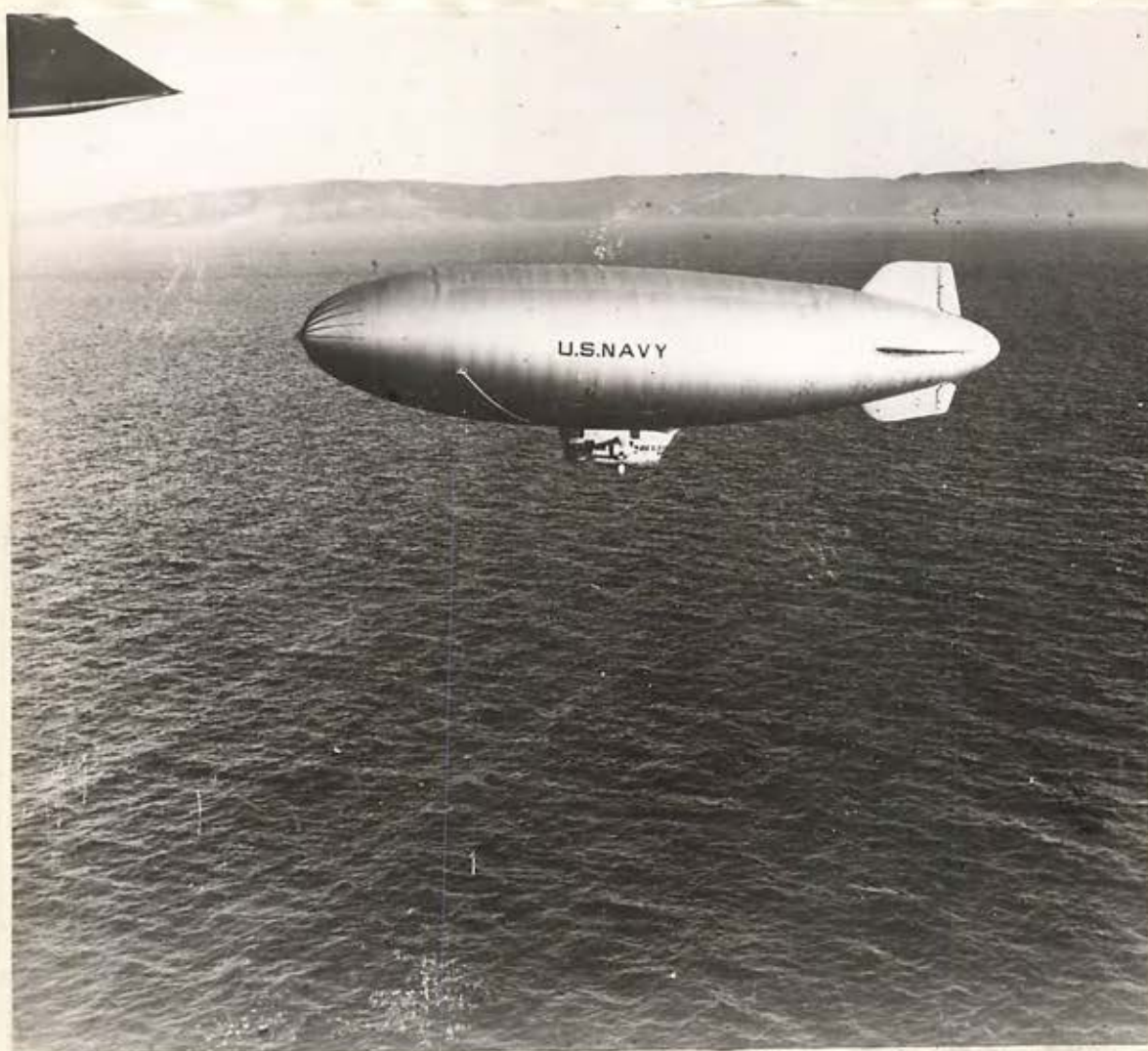
In the summer of 1944 the U.S. Navy began to operate Blimps on the night A/U patrol of the Straits. This one was photographed off the French Moroccan Coast. (26th June, 1944)