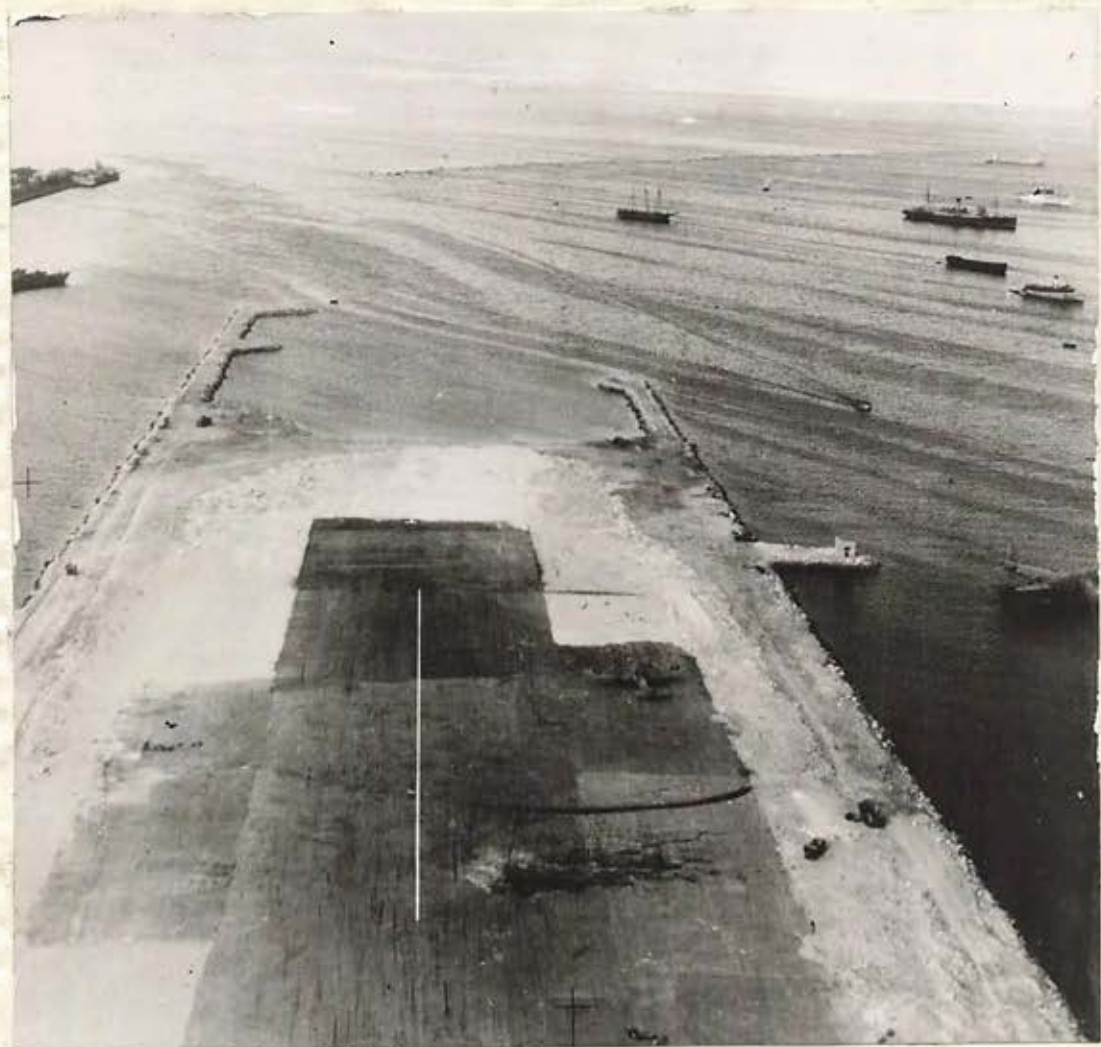
A Blenheim taxiing to the end of the runway. The centre has been completed but road-rollers and bull-dozers are completing the sides. It was on these sides that aircraft were parked before Operation Torch. (14th October, 1942)