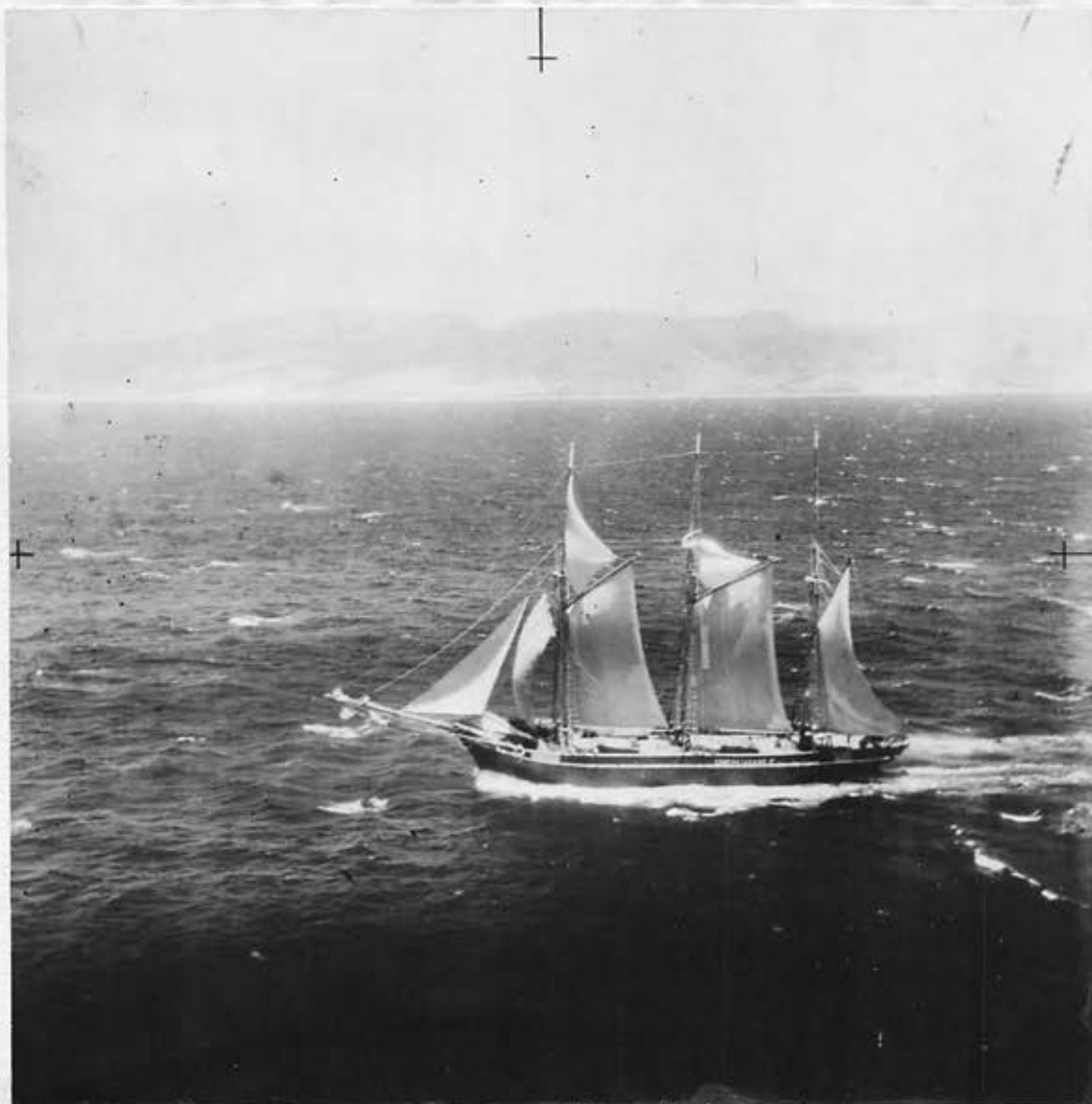
(8th August, 1943)