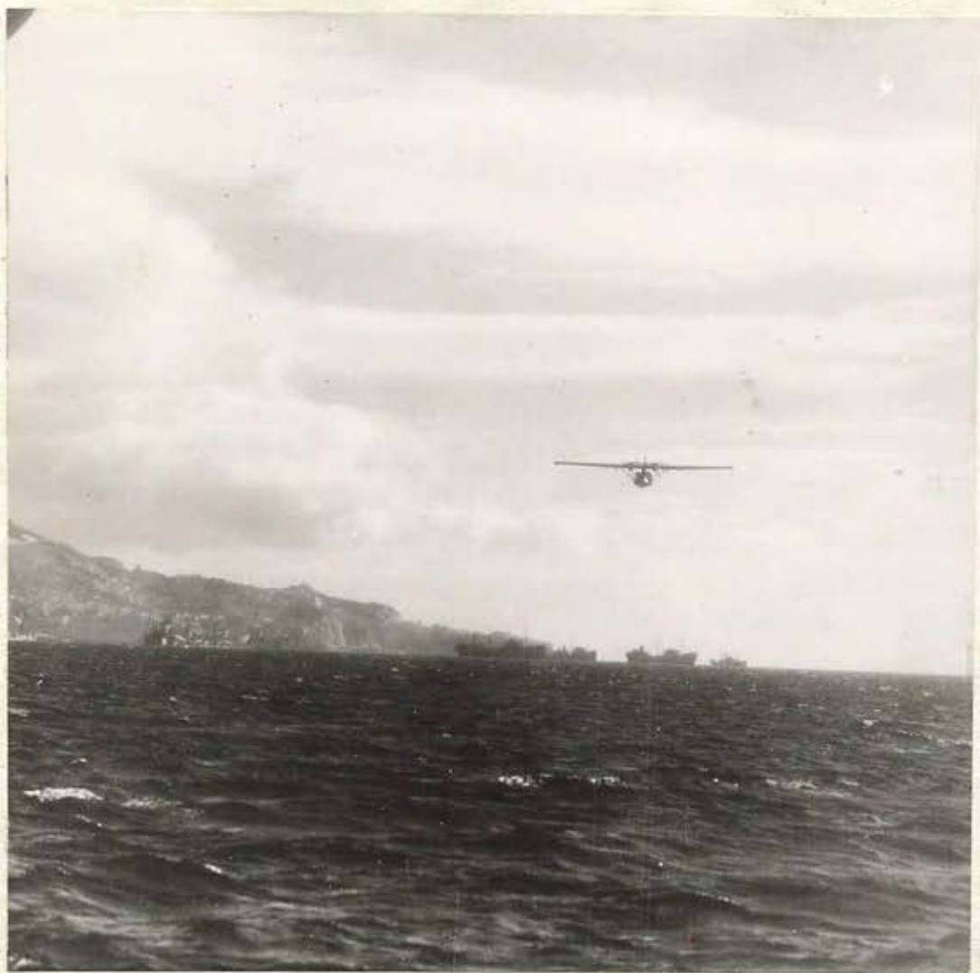
This Catalina has just rounded Europa Point on returning from patrol. (11th November, 1942)