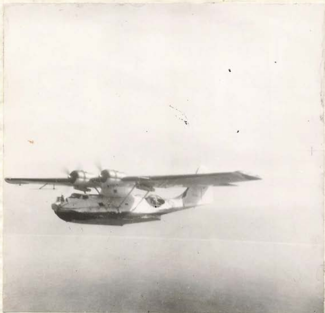
A Catalina of No.202 Squadron on A/U patrol over the Straits.