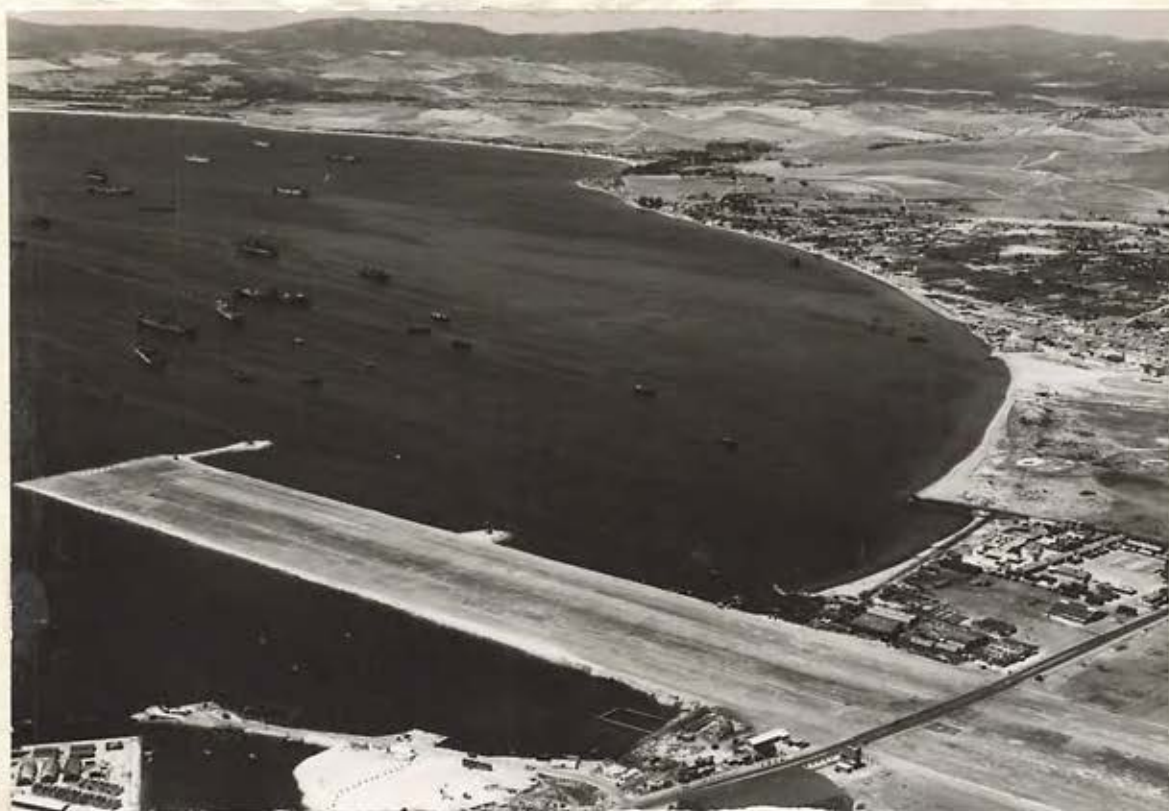
It can be seen from these two photographs taken near the summit of the Rock how the extensive ranges of hills in Spain could supply cover for a bombardment of North Front. (1943)