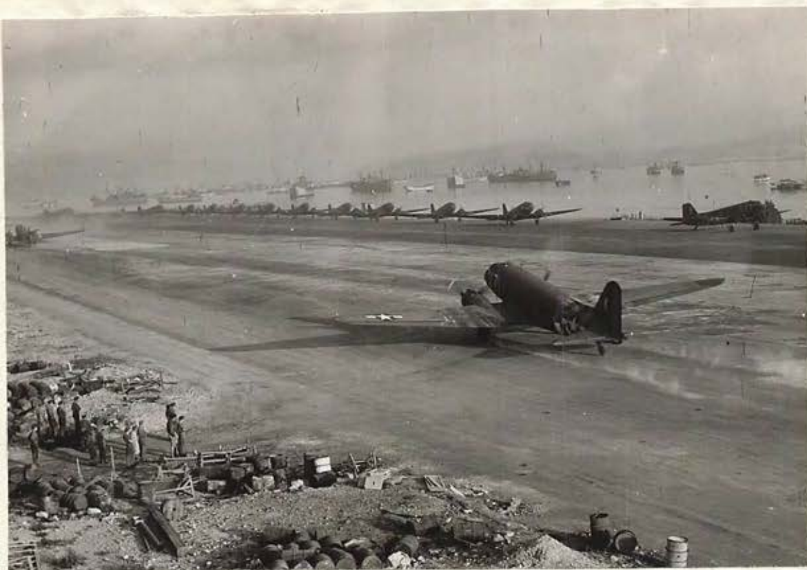
The Dakotas landing.