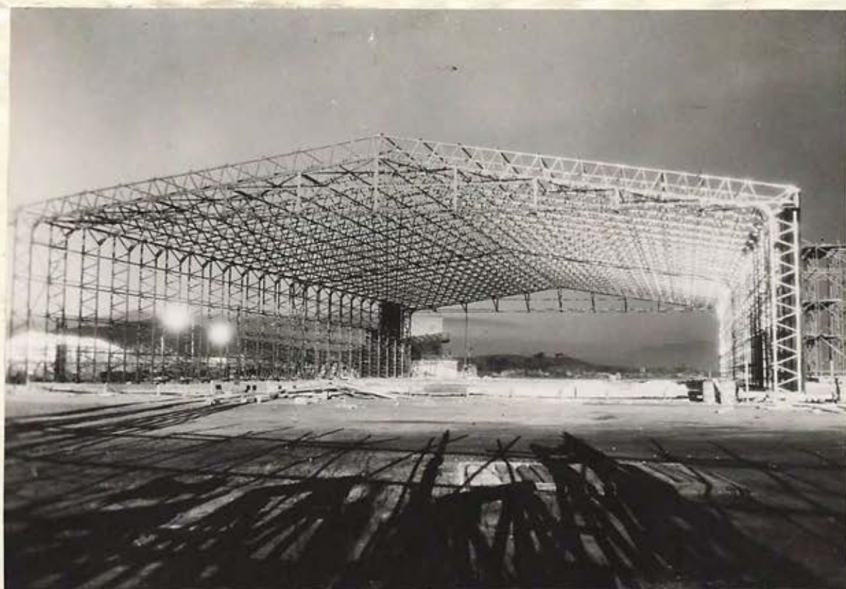
A hangar in the course of erection early in 1944 is lit up by the searchlights which swept North Front every night as a guard against sabotage and smugglers.