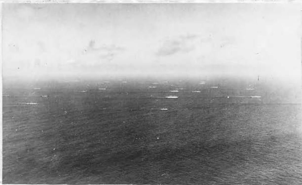
This convoy from Britain to the Mediterranean was one of those whose arrival at Gibraltar in the summer of 1944 was so popular - they contained the mail, as Air Mail had been stopped until after "D" day. (1st July, 1944)