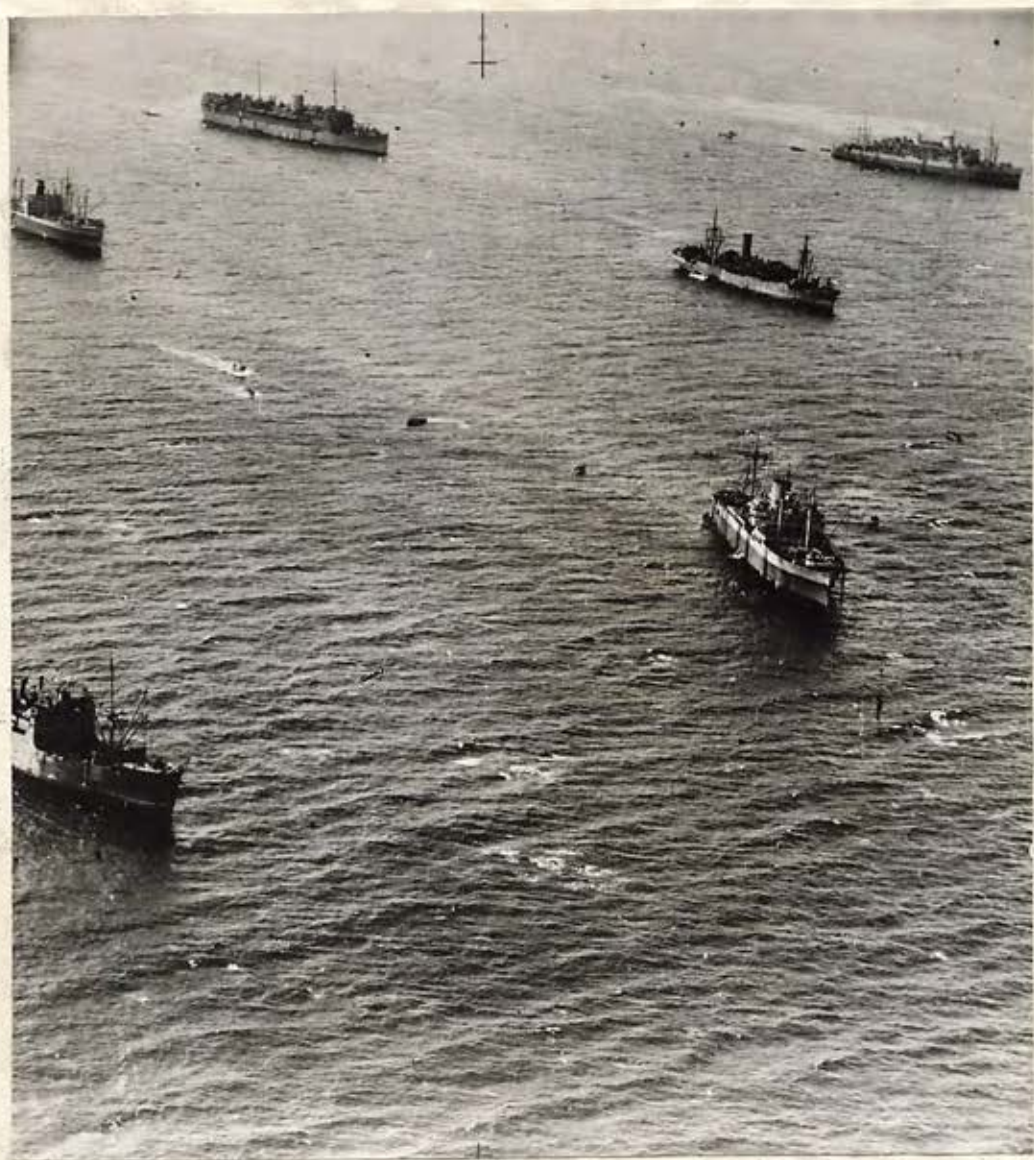
Ships from convoys escorted by Gibraltar aircraft discharging troops and equipment in landing craft off Algiers during Operation Torch. (8th November, 1942)