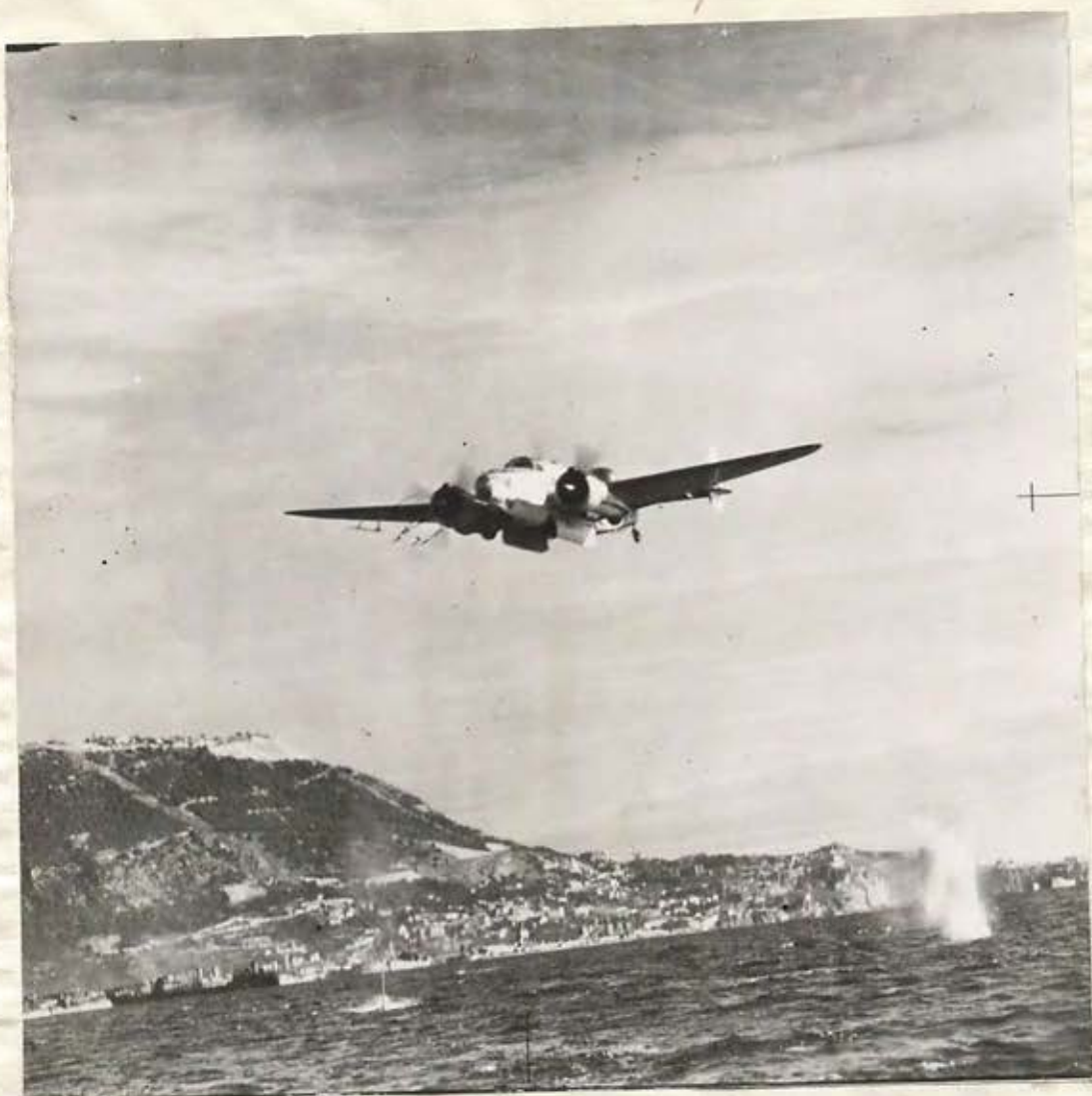
Hudson on depth-charge exercises over the Bay.