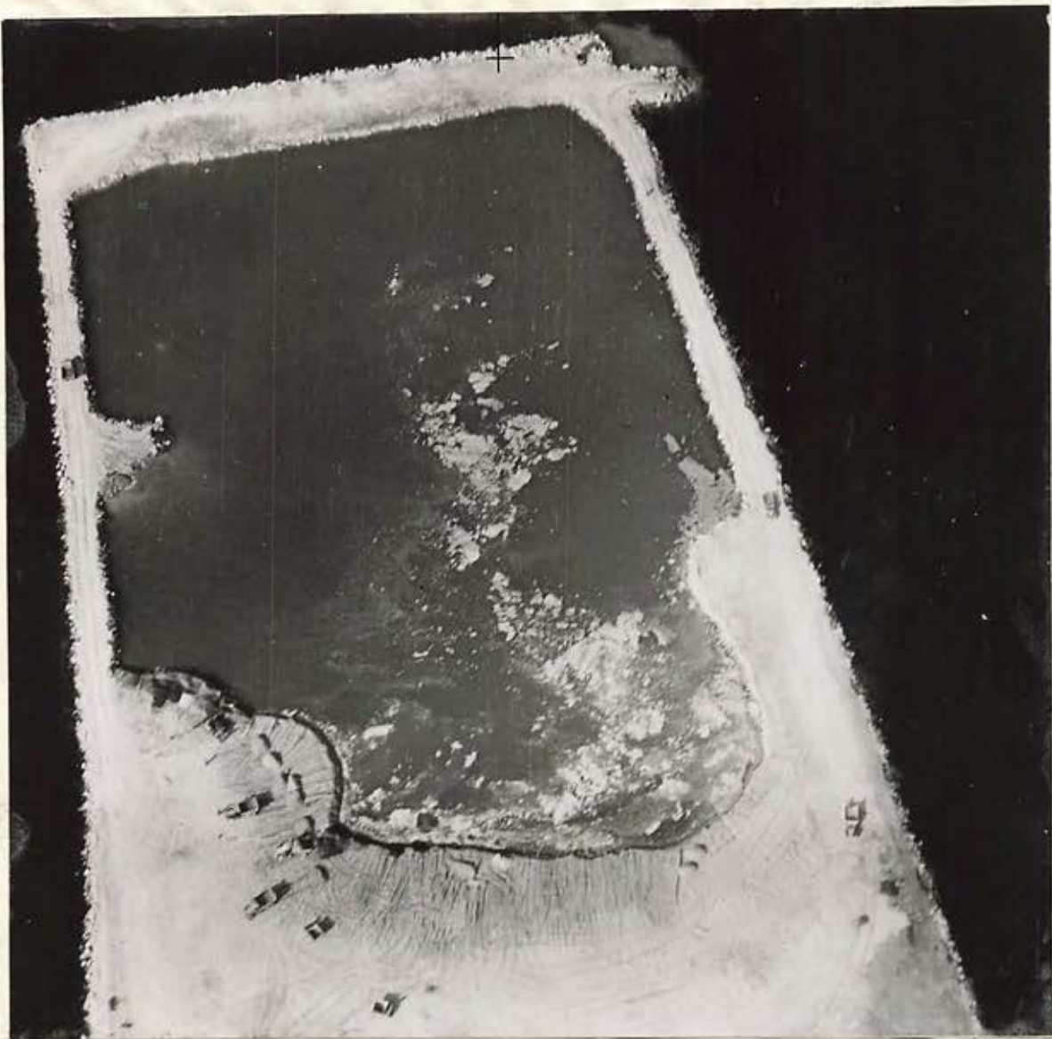
A close-up of the final reclamation work taken on the same day.