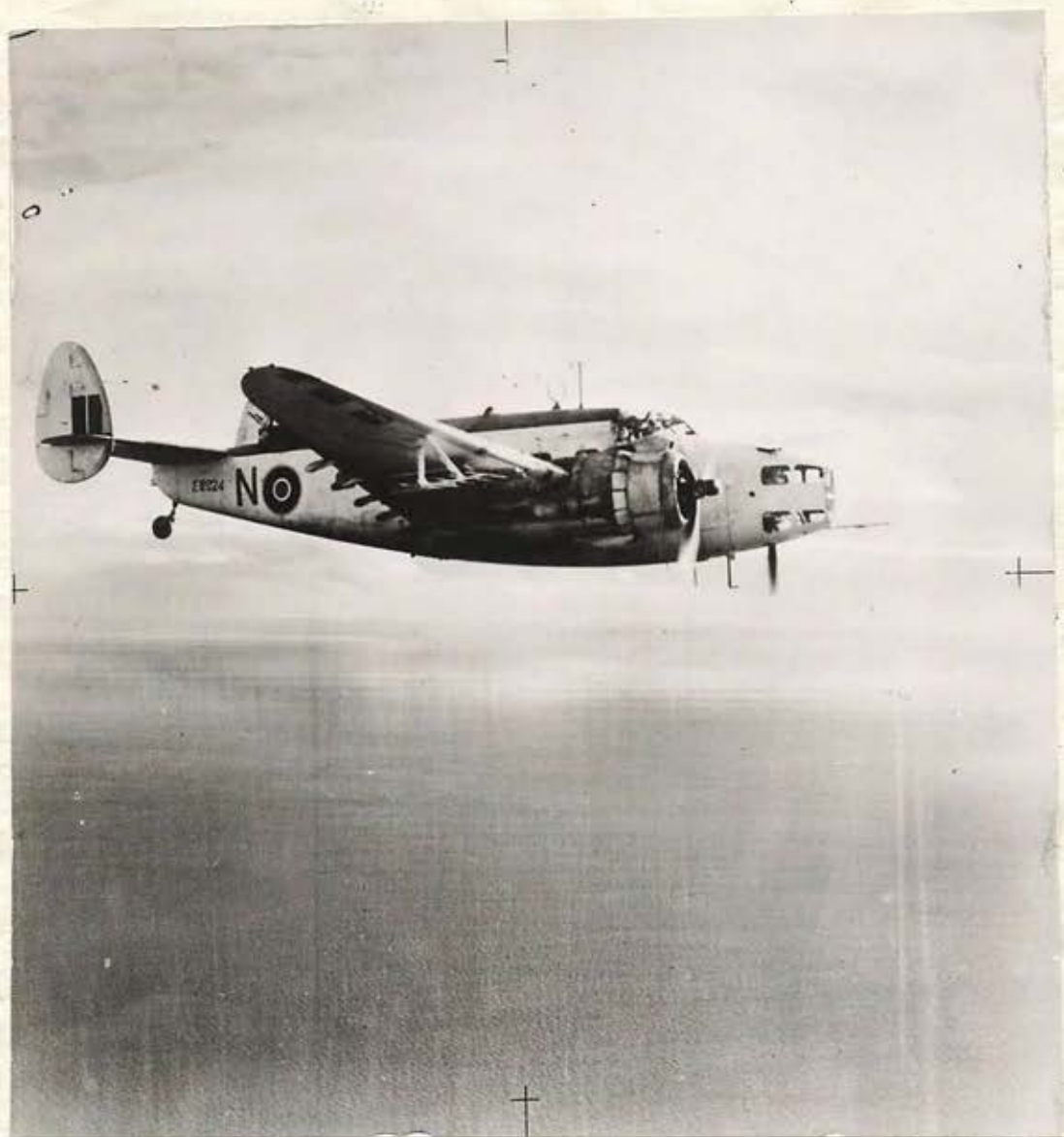
A Hudson returning from patrol off the North (46 SQN) African Coast. (6th January, 1943)