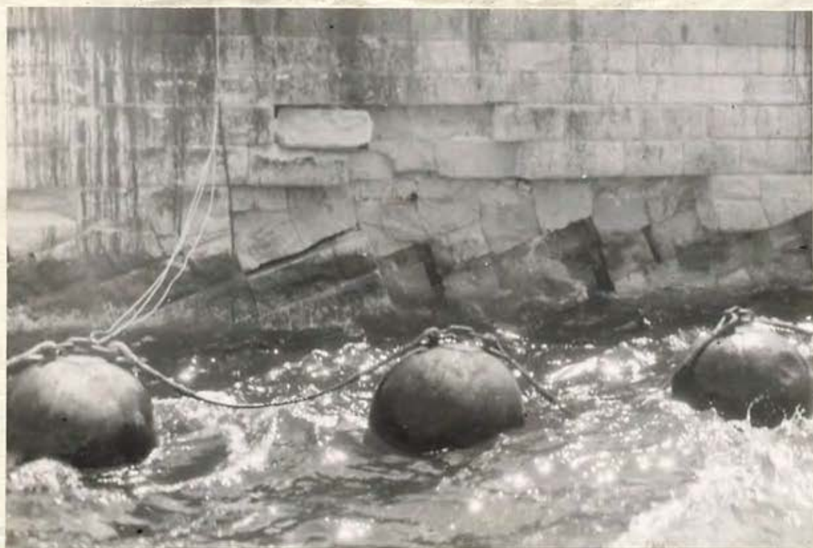
This is the damage done to Gibraltar by the Italian air raid on 5th June, 1944.