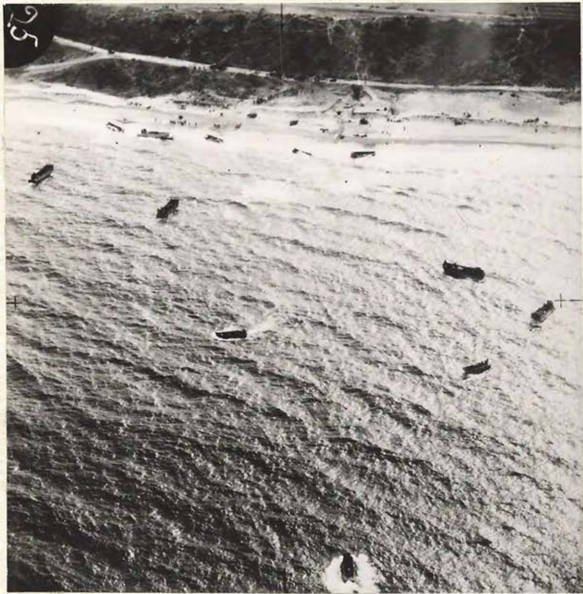
Landing at Sidi Ferruch.