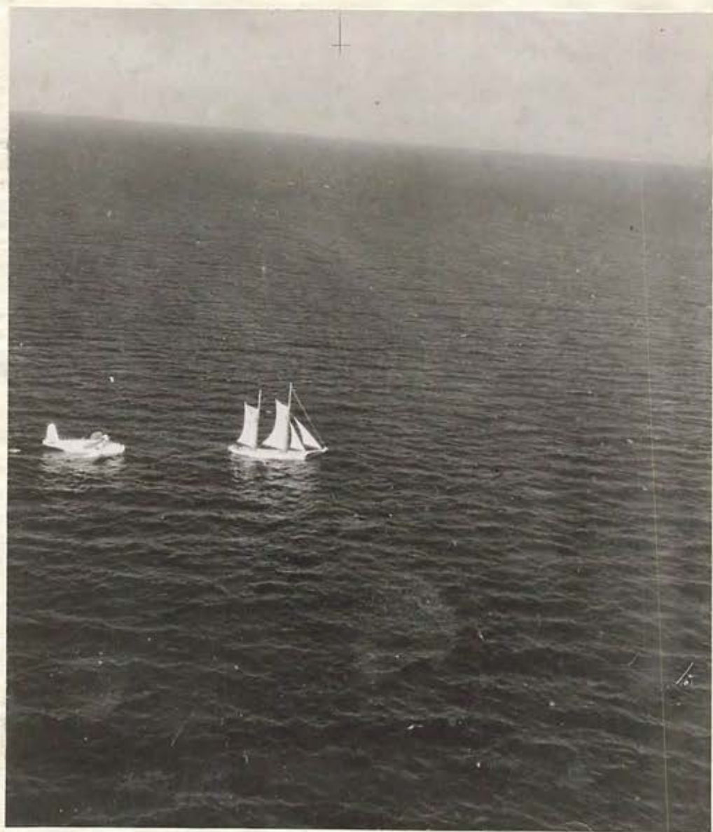
A French Sunderland in tow of a Spanish Schooner. A Gibraltar H.S.L. has arrived to take charge of the aircraft but does not appear in the picture.