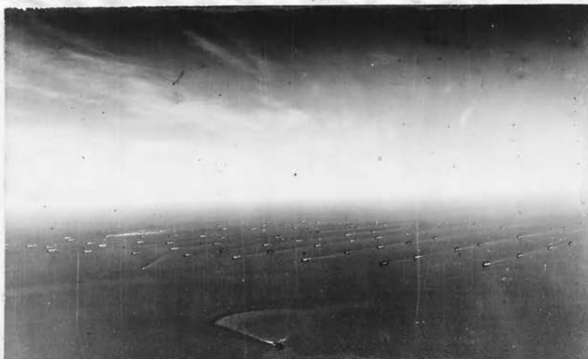
A Mediterranean convoy bound for the U.S. photographed from a Catalina of No. 202 Squadron on escort. (15th April, 1944)