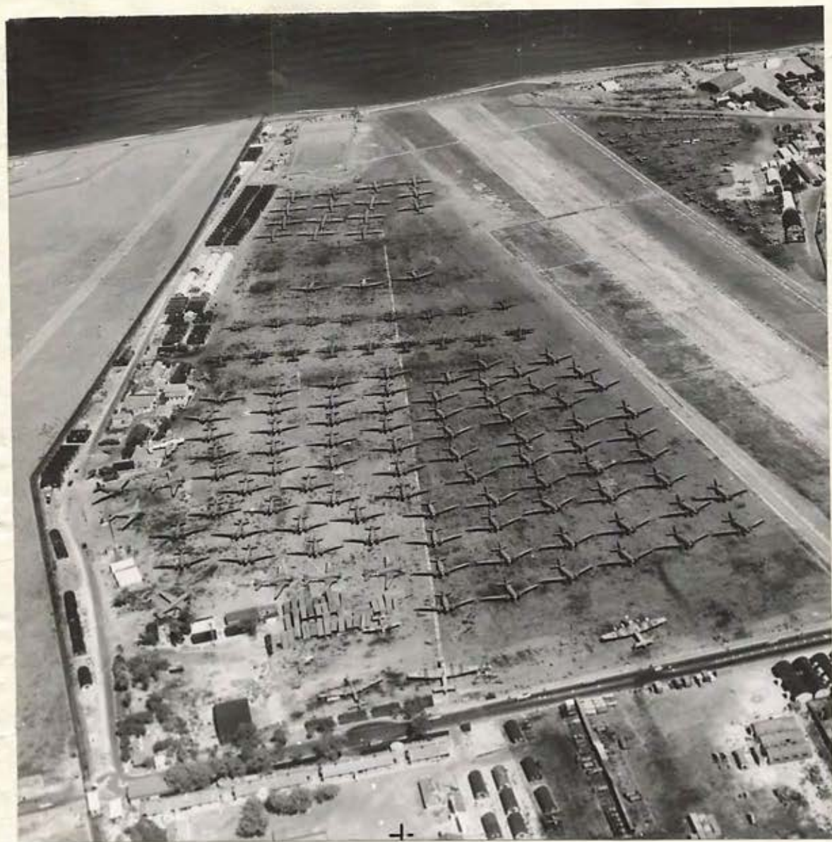
Over 100 Dakota troop-transport aircraft are parked at North Front for re-fuelling on their way to take part in the invasion of Southern France in July 1944. (18th July, 1944)