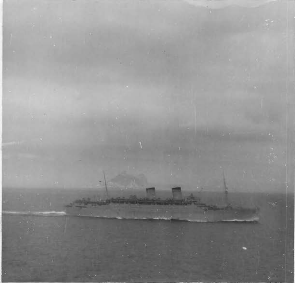
(8th April, 1945) Two contrasts in sightings - the Mauretania and a Spanish Wine Schooner.