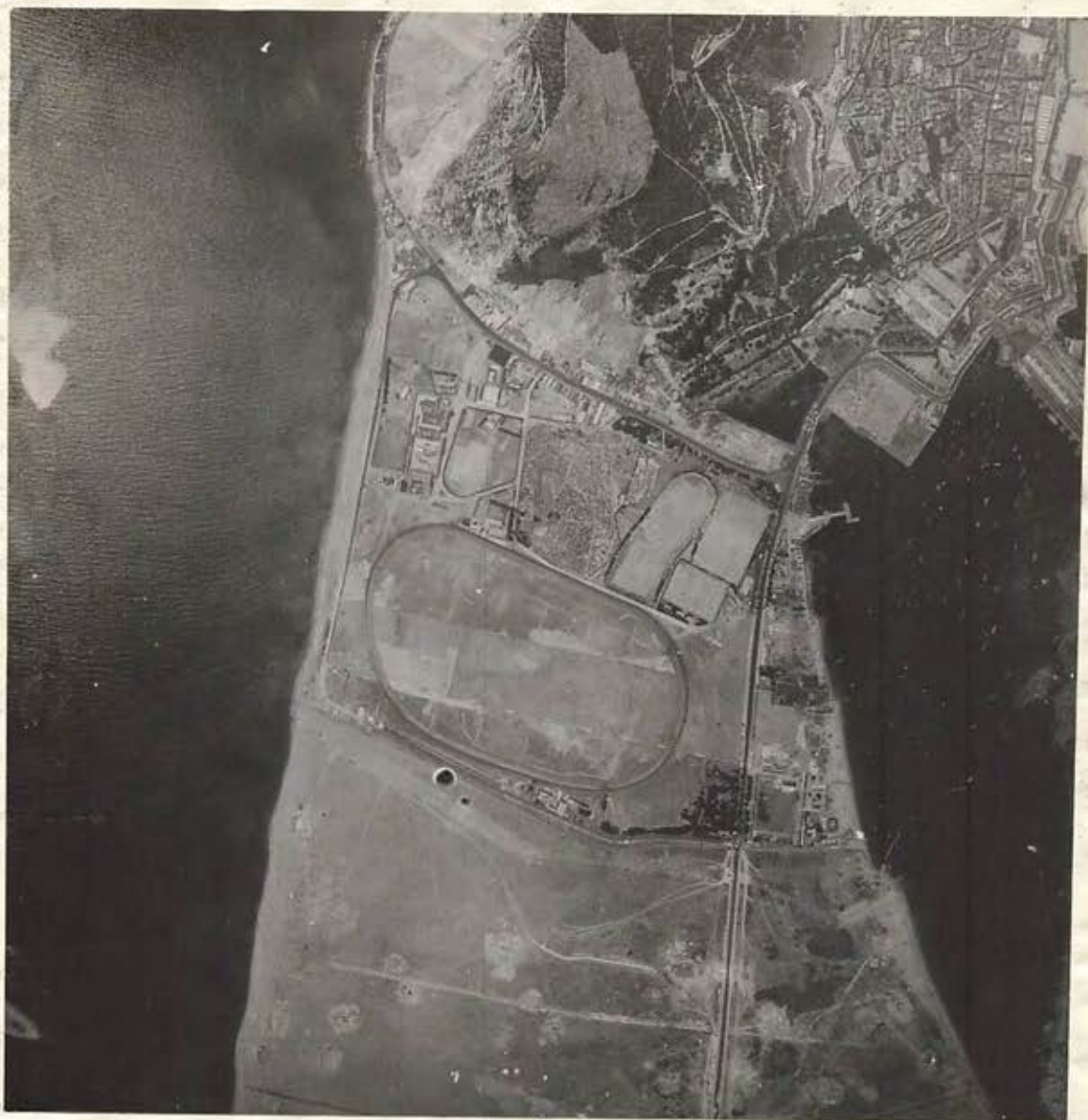
A view of North Front from the air. The race track is clearly seen with the "prepared strip" running across the course. The strip ended at the Spanish Road, leading into Gibraltar, which is the black line on the right of the picture. An aircraft is parked near the trees at the side of the Spanish Road. There are now defences on the Spanish ground. (7th May, 1940)