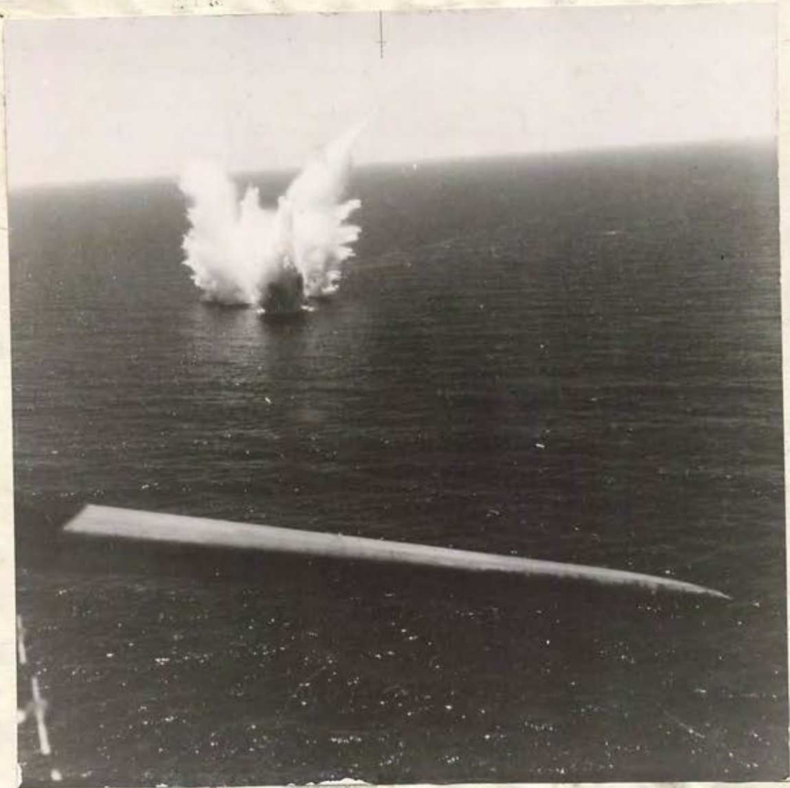
There is a U-boat in the midst of these depth-charge explosions. It was attacked in the Mediterranean by a Sunderland on 29th May 1942 and badly damaged in a fight which lasted several hours.